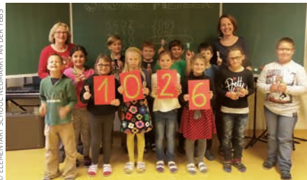
© ELEMENTARY SCHOOL NEUMARKT AN DER YBBS